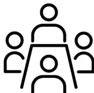
National Board of Advisors

support parents in protecting their child's innocence. We offer formation for parents as well as children, and we seek to involve the parents and siblings of STMA students in the life of the school.